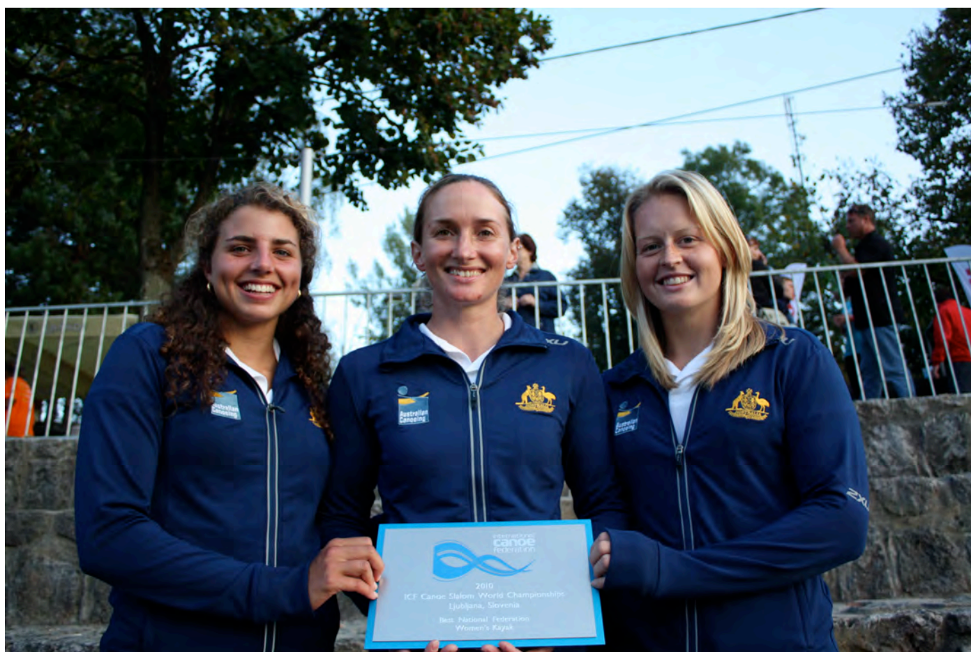
Australian Women's K1 Slalom Team - Team of the Year