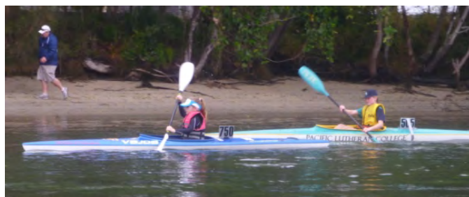
2011 QLD School Canoe Marathon Champs

“Basic/Intermediate Sea Kayaking Skills” and the launch of “Sea Kayaking Self and Buddy Rescues”. These books are available for purchase through our office and selected retail outlets.