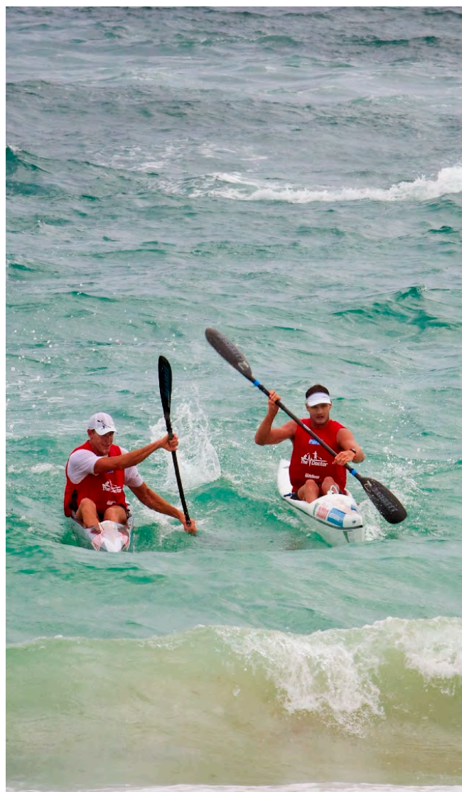
"The Doctor" Ocean Race

Finally, I must thank my fellow Board Members and staff members, who are so professional and have worked so hard to improve Canoeing in Western Australia. We as a Board believe the next few years will see some fantastic results in all areas of the sport that we love.