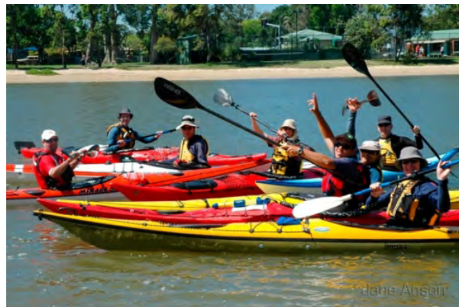
2010 National Sea Kayak Symposium

We now look forward to running even more events this year in line with the launch of the NEDP. This pathway becomes a major focus for the future of our paddlers as Queensland Canoeing acknowledges 28 of our high performance athletes that have competed in National teams this past 12 months, and as we look forward to our State’s continued contribution to these teams at all levels and all disciplines.