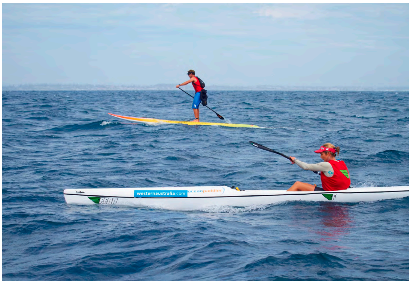
"The Doctor" Ocean Race